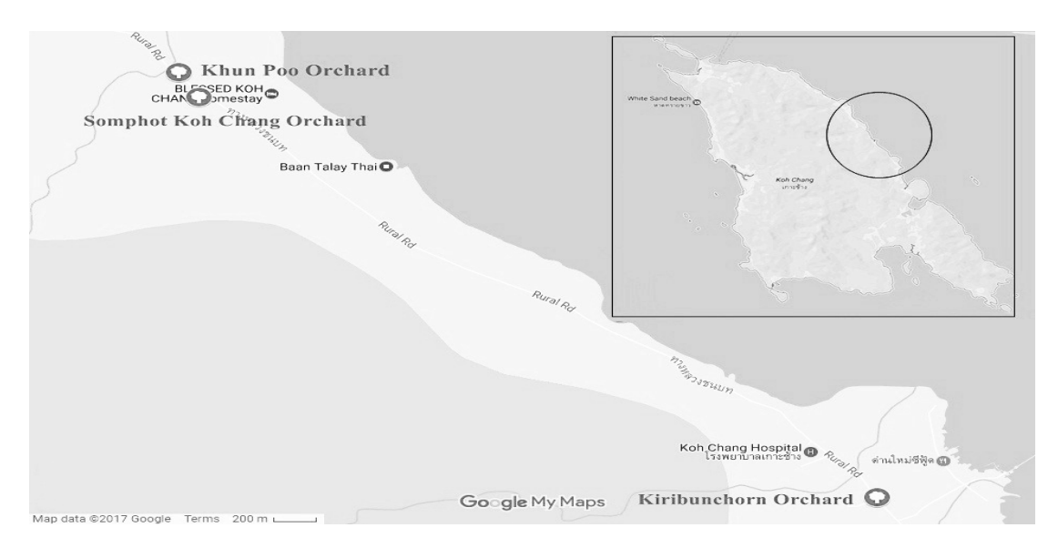
Figure 2 Map showing the location of the sampled tourist orchards in Koh Chang district